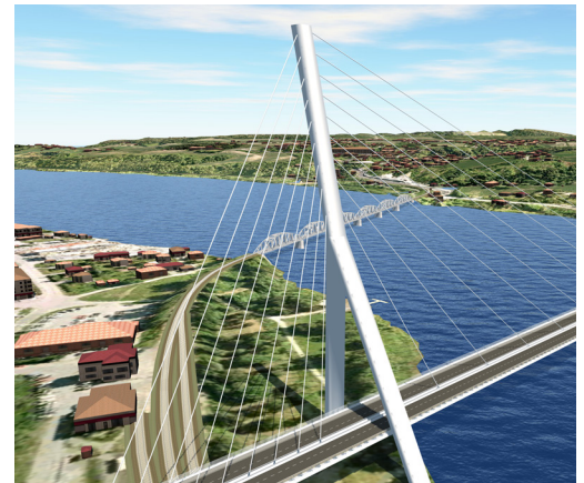
Close-up view of bridge design.

—Birger Opgard Project Leader Multiconsult AS