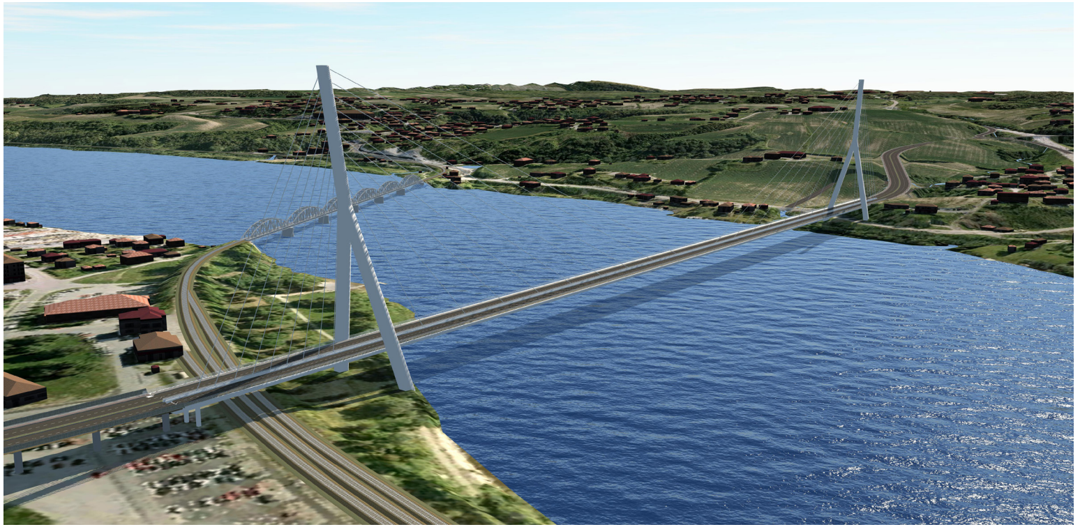
View of a Twin Tower Cable-Stayed Bridge.