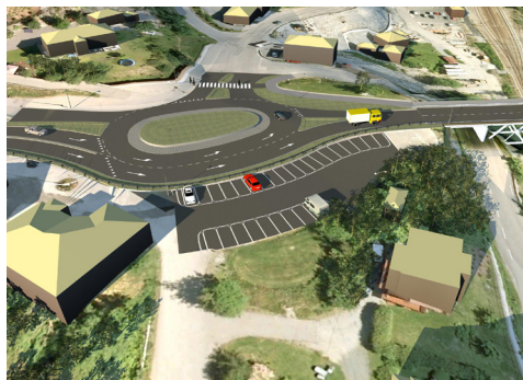
Proposed upgrade of existing traffic light regulated intersection

In contrast to studying plans on 2D drawings and maps, the 3D project visualizations gave us a much better idea of how the various road corridors will affect the landscape. We have received a lot of positive feedback on the project simulations and there is no doubt that the InfraWorks software raised the quality of the feasibility study and increased interest in our road planning effort.